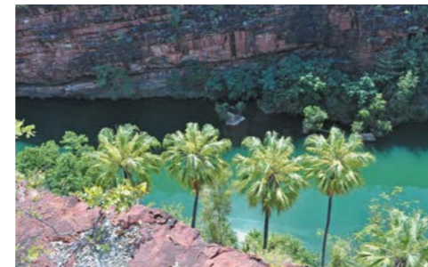
On top of The Stack looking down into the gorge