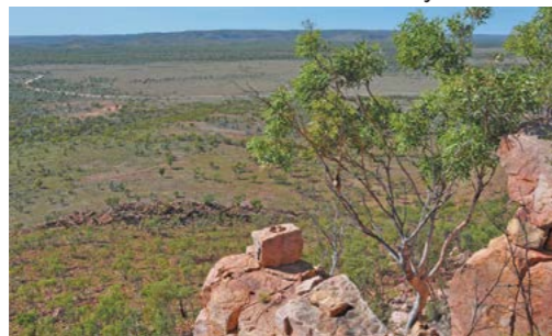
Six stones at Boodjamulla NP

Boodjamulla is a National Park in the Gulf Country of north-western Queensland, 340 kilometres northwest of Mt Isa and 1830 kilometres northwest of Brisbane. The park has massive red boulders, ochreous bluffs, deep canyons slicing into vast sandstone ranges, and limestone plateaus holding ancient fossil fields. The rivers