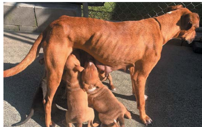
Almost wasted away, but still providing for her babies.

This darling girl was found living as a stray on a beach in Northland. Absolutely emaciated, we don't know how she was still managing to nurse her five newborns, but somehow, she was. Luckily for all of them, they were rushed into our SPCA Centre in Whangārei, where our team was heartbroken to see the state she was in. In testament to her care for her babies, the puppies, aged about 3 weeks old at the time, were all in amazing health despite being born as strays.