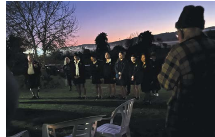
Dawn ceremony at St Stephens Church