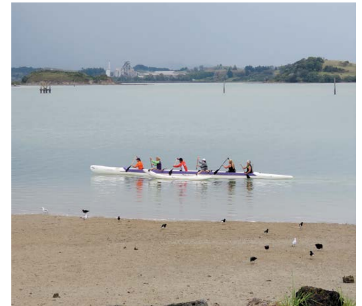
Watersports in the harbour

We are currently looking for new Committee Members. If you are interested in joining PBRRRA, and can contribute a few hours a month towards your community, please contact us on paruabayrra@gmail.com . We would love to hear from you.