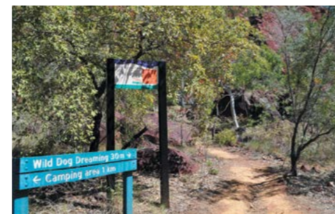
Path to Wild Dog Dreaming

Finally, we took the Constantine Range Walk with its wide expansive views stretching to the horizon. What an incredible feeling it was to stand on top of a massive red bluff where the horizon was limitless, the majesty and scope of the surrounding landscape daunting. That was why we paid tribute to our grandchildren there among the commanding ochreous bluffs of Boodjamulla. Boodjamulla gets into your soul, the National Park revealing an ancient place, permitting you rare glimpses into the enormity of Queensland's current beauty and geological past. We hope our grandchildren will one day climb the rugged Constantine Range to enjoy the grandeur and history of this wonderful place. Maybe they will discover the individual stones we placed for them with such love and care so long ago.