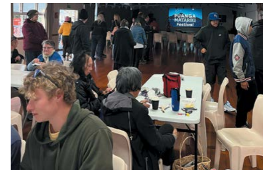
Queuing for the hangi