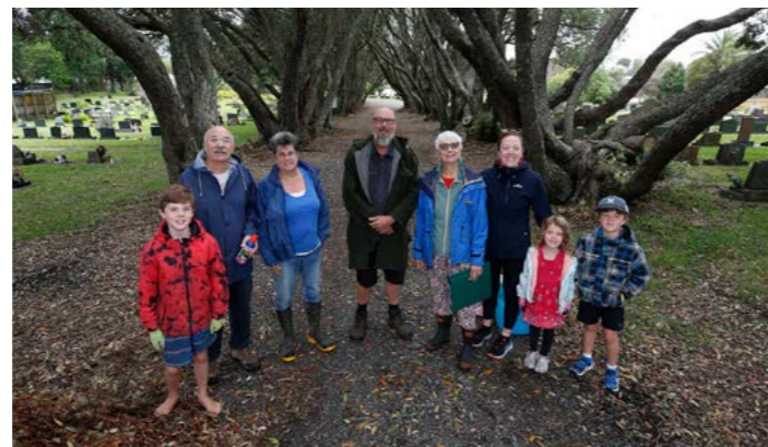
Some of the volunteers at a previous Onerahi Cemetery Clean Up Day.