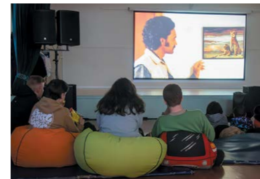
Watching the movie 'Boy'