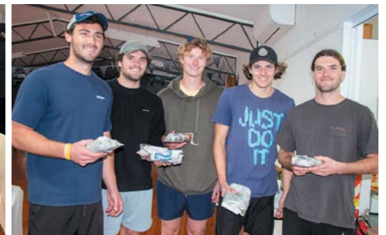
South African and Irish visitors