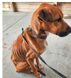
Sadie when she was found