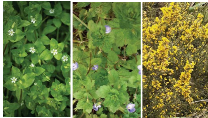
Chickweed Speed Well Gorse

Gorse (Ulex europaeus), love it or hate it, but it has many uses. It's a great soil nitrogen fixer and also helps stabilise erosion. The flowers have a lovely scent and can be eaten or used as a tea. It makes great firewood too. Traditionally,