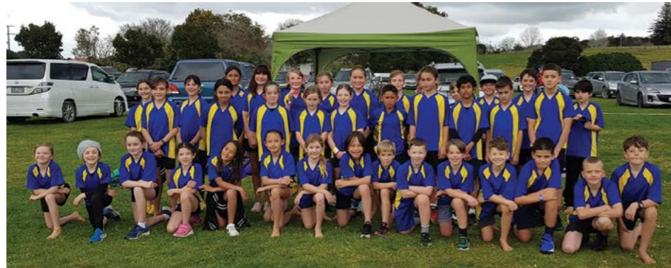
Onerahi School cross country team