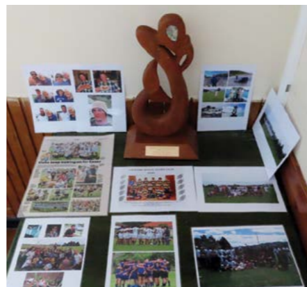
The taonga and a display of a few photos