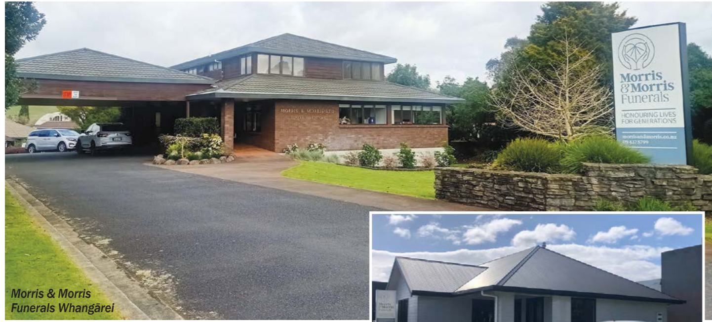
Morris & Morris Funerals Whangārei