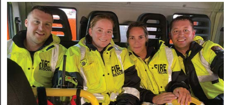
The first time the four of us were on a call all together.