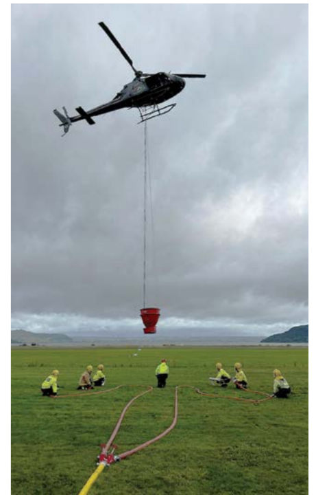
A training exercise during our QFF course