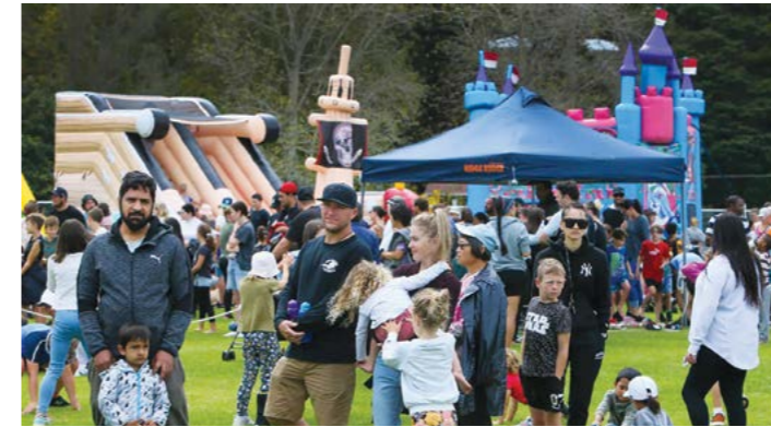
The Whangārei District Council's Family Fun Day