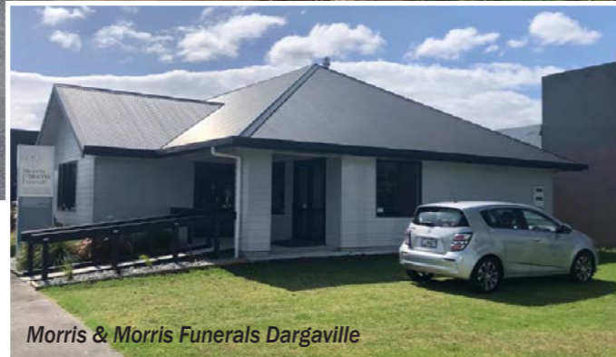
Morris & Morris Funerals Dargaville

When you contact us to arrange a funeral service for a loved one, you are usually in some degree of shock. That is what the death of someone we love and care for will do to you. Shock, or grief more particularly, slows you down, it cocoons you in numbness and disbelief. This is the body and mind's way of protecting you for a while. This is all perfectly normal.