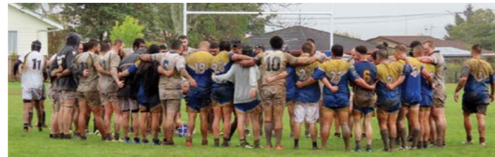
At the end of the game - a bonding circle of all the players