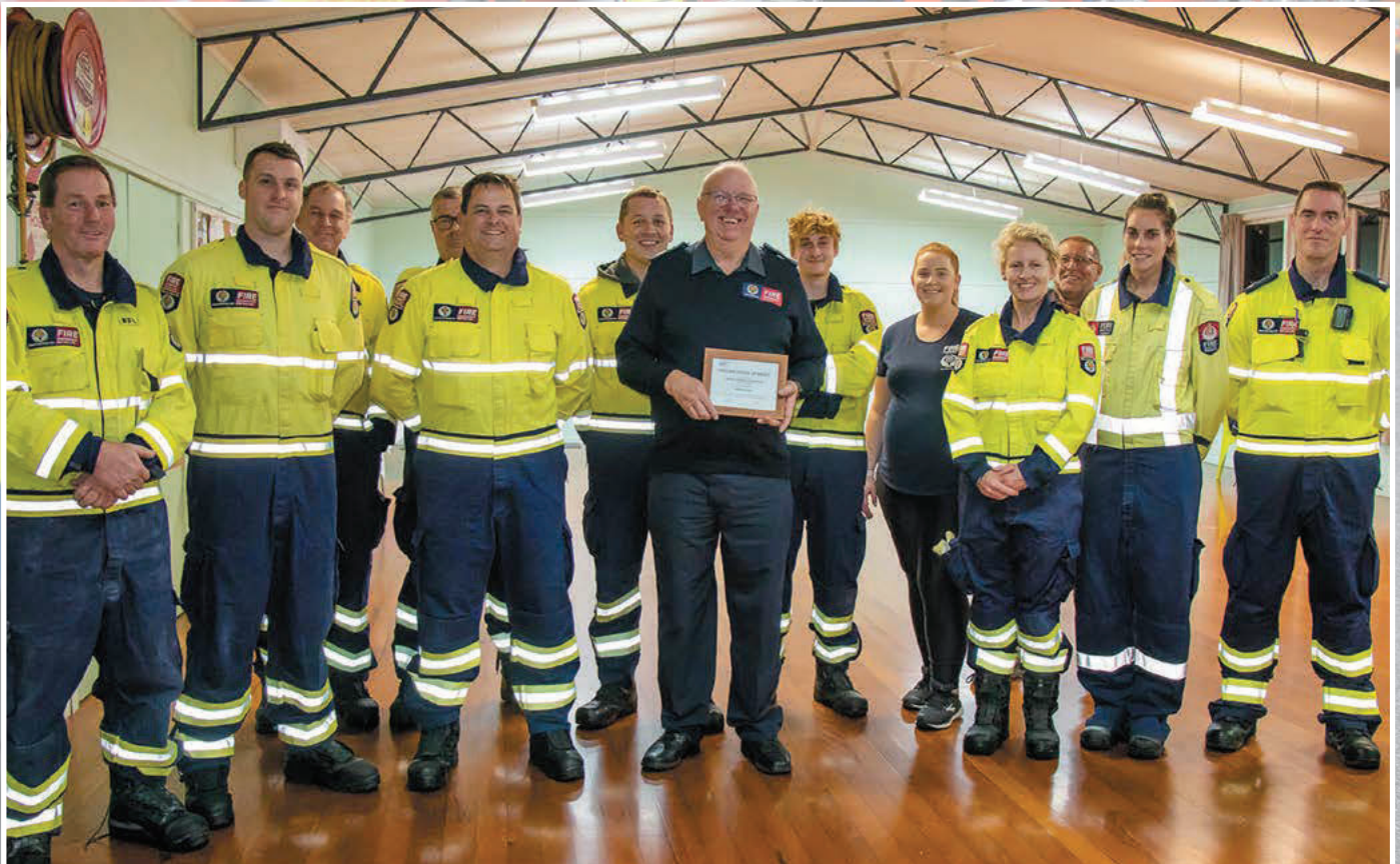
Onerahi Volunteer Fire Brigade, 15 June 2021

Covering Onerahi, Parua Bay, Pataua and Whangārei Heads