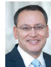
Dr Shane Reti