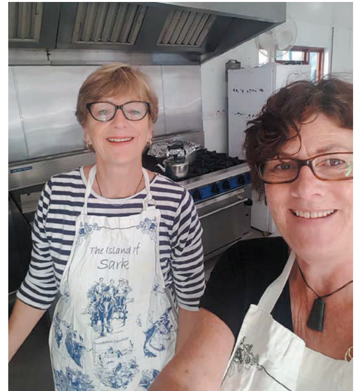
Kiwis in the kitchen. We faked it until we made it