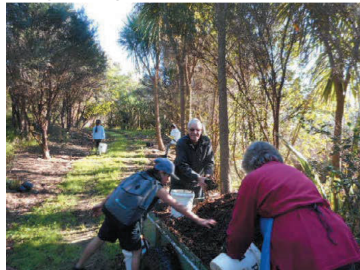
Adults and students mulching together

Today the children were full on helping our volunteers planting & mulching trees.