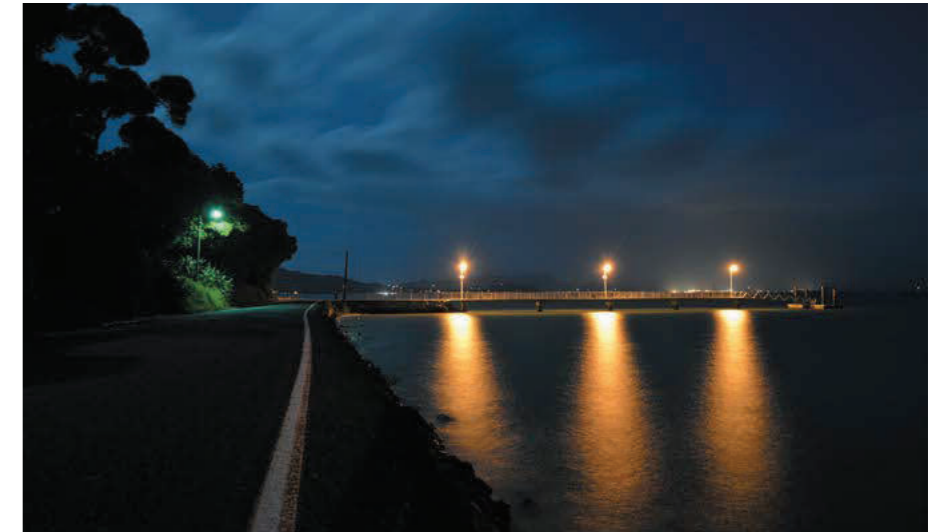
Onerahi Jetty at high tide on a winter evening.