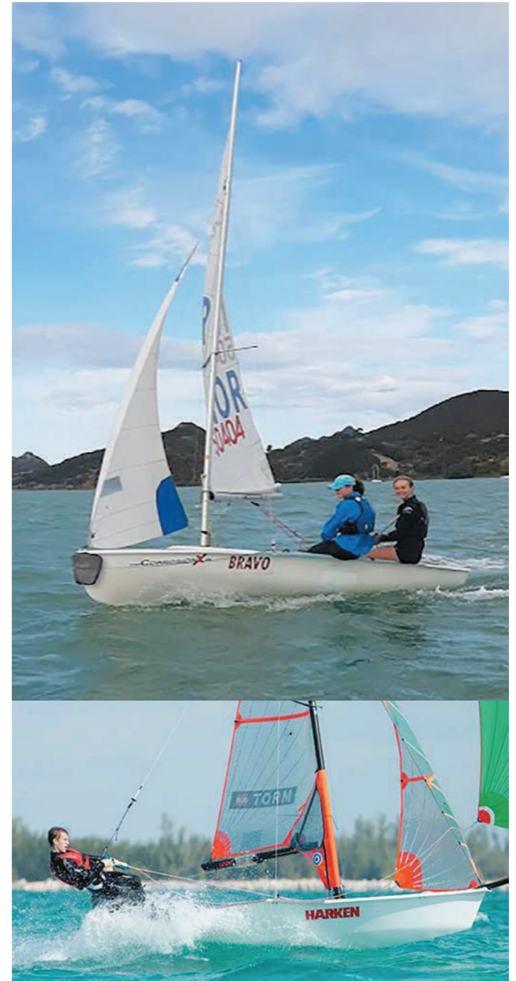
Winter sailing with a group of keen high school sailors every second Sunday in Terms 2 and 3