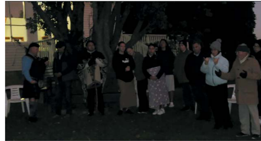
Our first Matariki holiday was widely embraced by the Onerahi community.