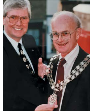
Chairman of the Barnoldswick Council