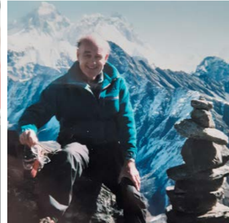
Climbing Mt Kala Patur, with Mt Everest in the background