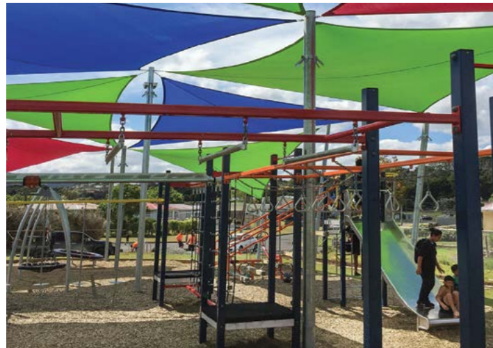
The Otangarei community were in complete agreement on getting a playground for the kids. Previously there was nowhere for the kids to play.