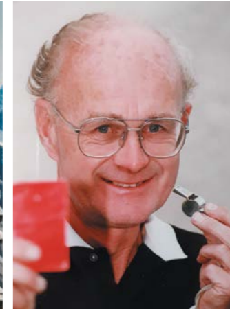
50 years of service to football