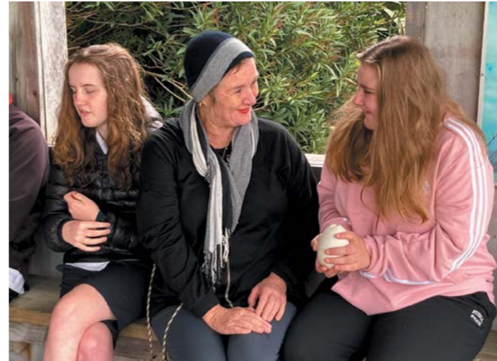
Blomfield Special School students with wax filled kiwi egg