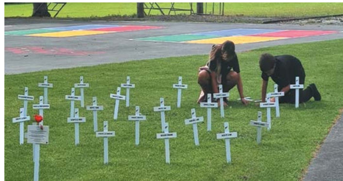
Anzac art and laying crosses in field of remembrance