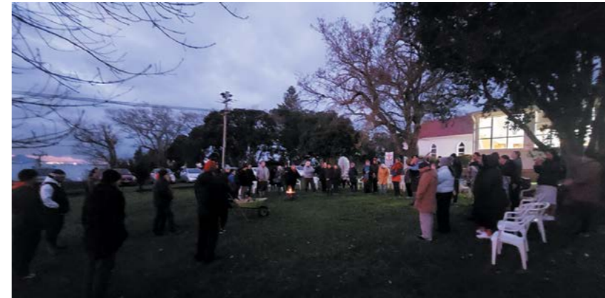
St Stephens Church Matariki Celebrations