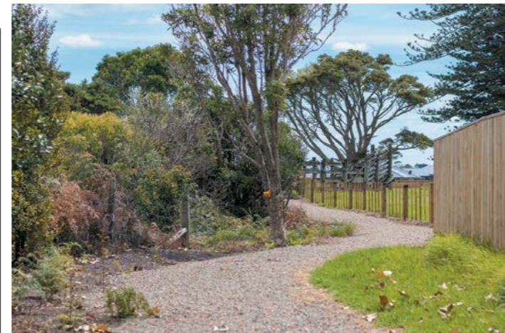
Waipu - Waipu/Waihoihoi River walkway. Officially opened on July 16th 2022. For more information go to www.facebook.com/waipuriverwalk