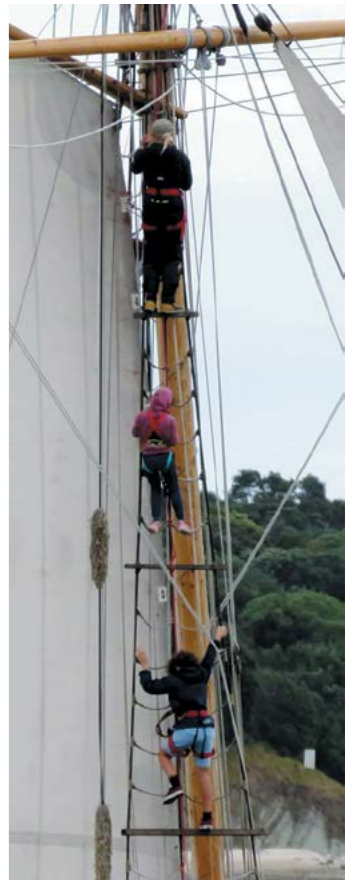
Youth Development Voyage grants are available from the R. Tucker Thompson (not-for-profit Charitable Trust)

Condensed from the Mayor's opinion piece, 4th July 2022