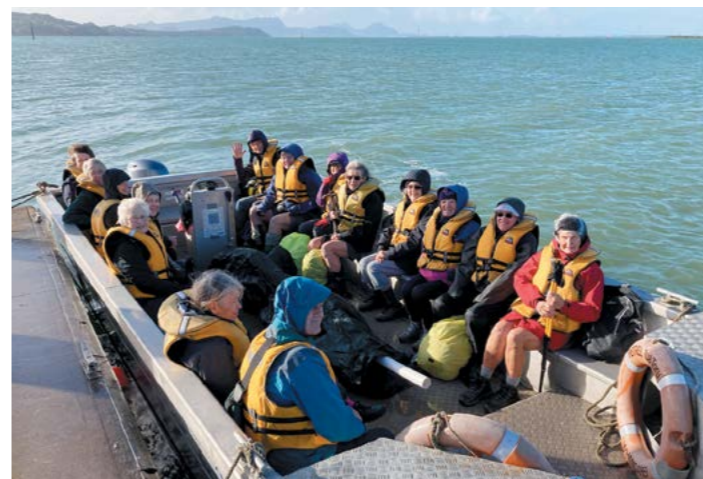
Ladies tramping group about to set off for Matakoho