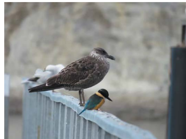
Kingfisher - Young Karoro and Kotare side by side