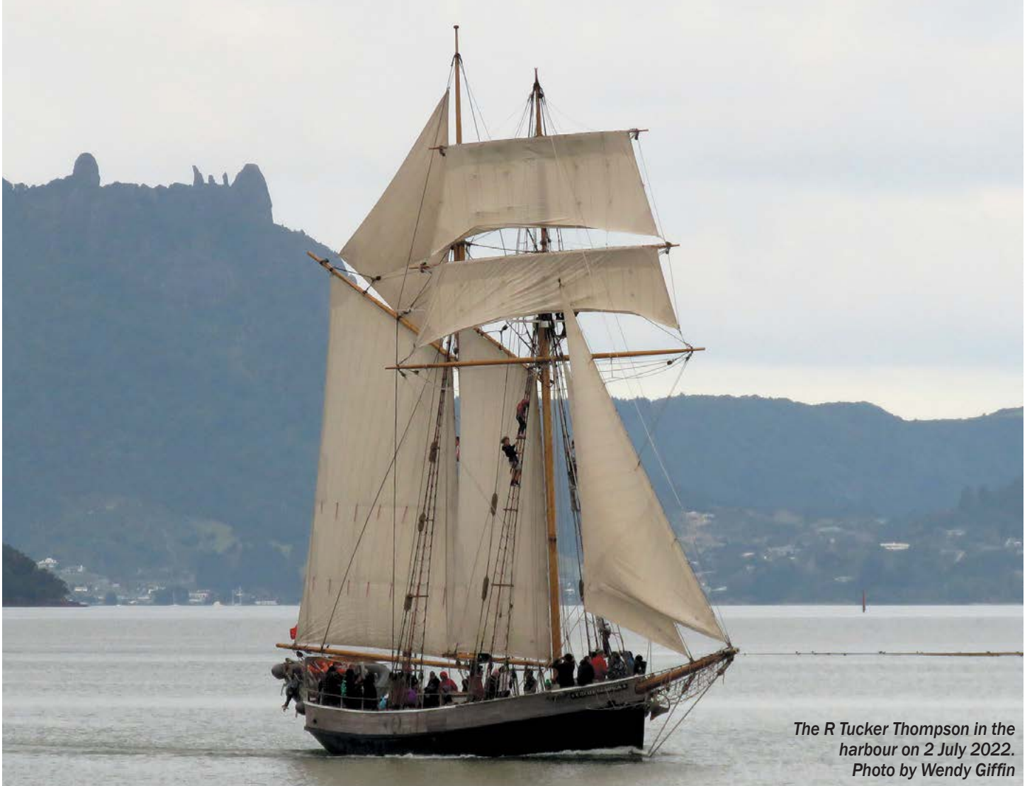
The R Tucker Thompson in the harbour on 2 July 2022.

Covering Onerahi, Parua Bay, Pataua and Whangārei Heads