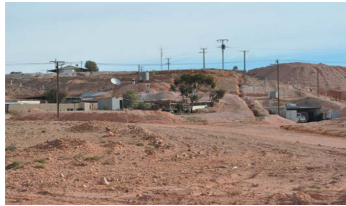
The weird residential landscape of Coober Pedy

Some buildings in Coober Pedy are above ground such as the supermarket and caravan park though they both have underground equivalents. There is also an underground museum in the centre of town. Well worth a visit, the galleries