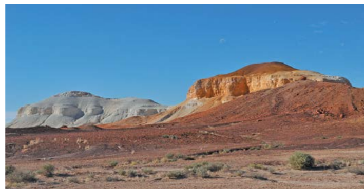
The Breakaways near Coober Pedy