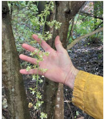
Kohekohe flowers with Dwane's hand for perspective