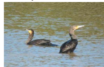
Cormorant - Black Shags - the largest of the cormorant family