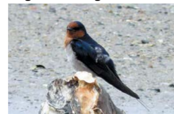
Swallow - Swallow on an oyster rock