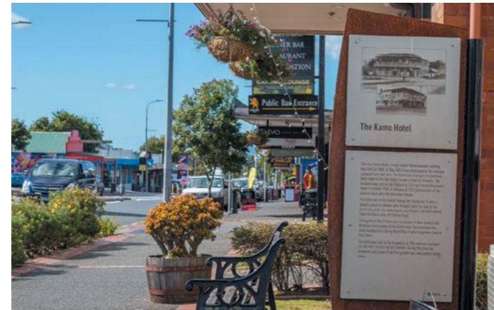
Flower baskets and Kamo Heritage Trail signage in Kamo - The Kamo community opted to do heritage signs to complement the Tales of Kamo. The community also got a number of murals and flower baskets installed to brighten the area.