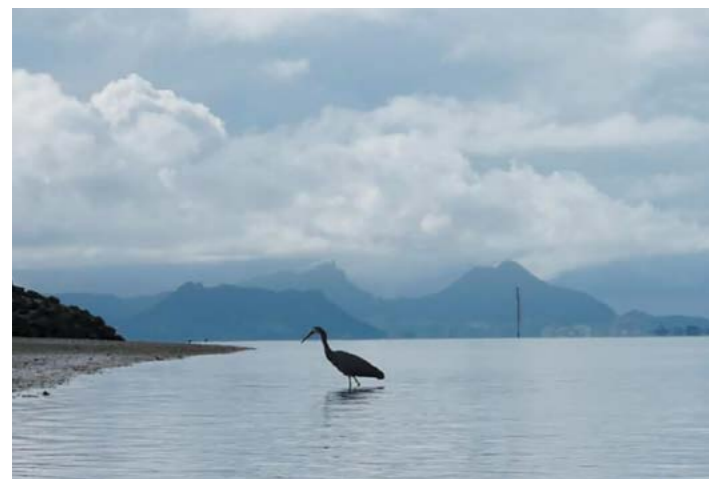
Heron - White Faced Heron