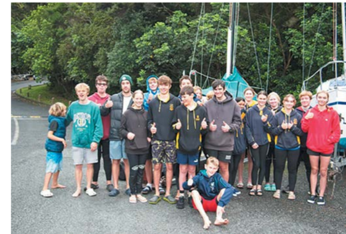
GJ Gardner New Zealand Open Team Racing Nationals Sat 4 Jun 2022 to Mon 6 Jun 2022

Over Queen's Birthday weekend, 2 teams went up to Kerikeri and competed in the NZ Open Team Sailing Nationals. The girls' team (Tangled) came 9th Overall and the boys' team (Wet asses) came 6th Overall. Very light wind regatta, but it was great training for everyone. Parua Bay doesn't usually offer us light wind sailing so it was a bit of a challenge.