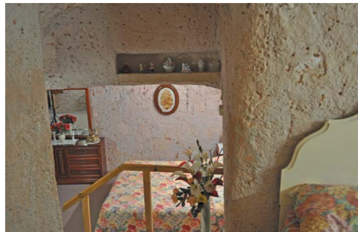
A typical dugout in Coober Pedy

Surprisingly, the region is also rich in Aboriginal and European history and home to an array of native fauna and flora that have successfully adapted to the harsh environment.