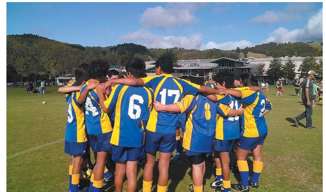
Onerahi players huddle during a game.