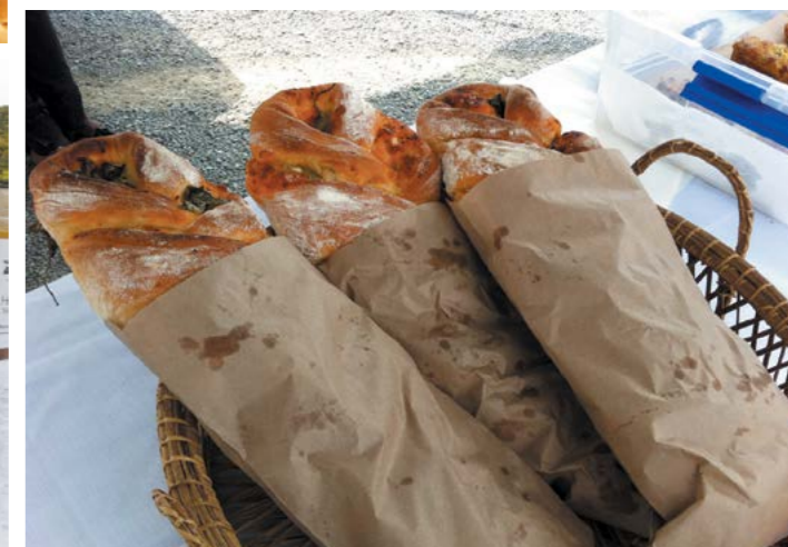
A range of delicious food is available at the markets.