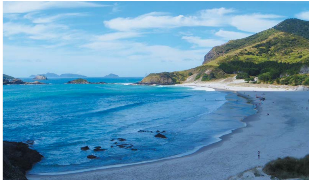
Ocean Beach, home to Whangārei Heads Volunteer Surf Life Saving.

It's summer time and everyone knows to slip on a shirt, slop on some sunscreen and slap on a hat, but there is a lot more to take under consideration when you're heading to the beach.