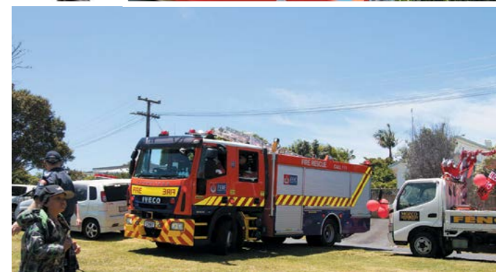
ABOVE: Santa entertains the crowds.

Entertainment will be provided by the Kiwi Breeze Band and a performance by Heads Up Adventures on the skate ramp as well as a display by Skatescool, on the Basketball Court.