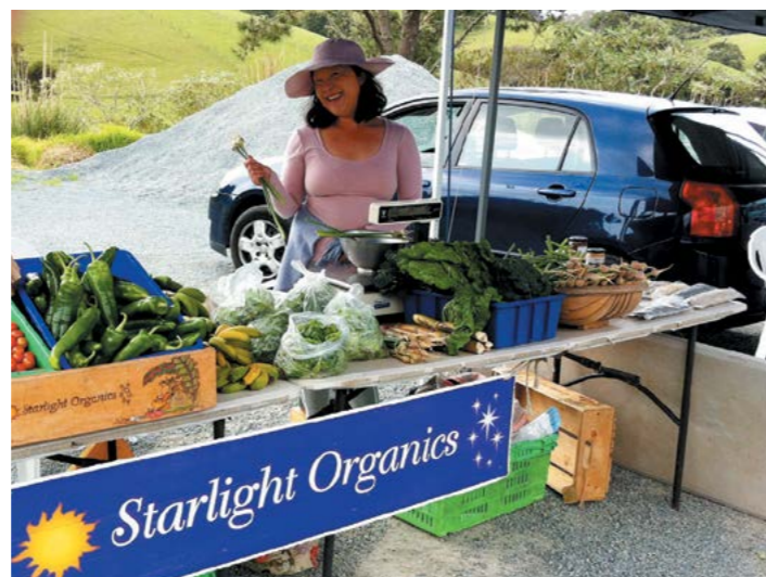
Starlight Organics with their beautiful fresh produce.

eggs, artisanal bread and sausages, came to fruition, two years ago, and as it grew, it also began to feature local artisans who sell paintings, pottery, carvings or other wares. "The only criteria to be a vendor is that you must make, bake, grow or sew what you sell."