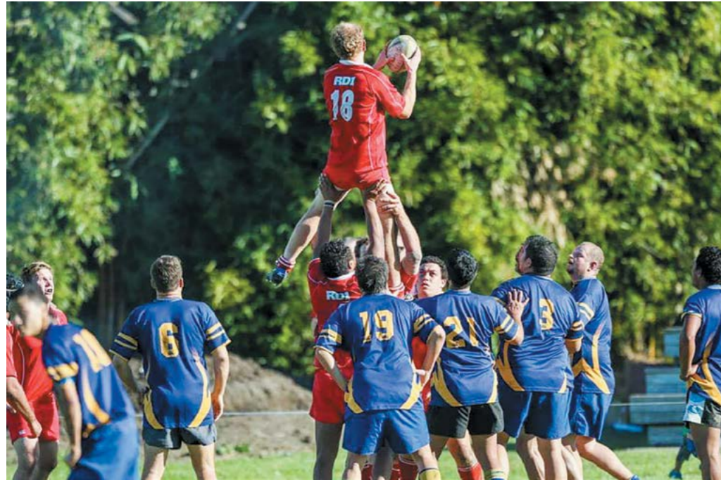
Keeping up with the play.