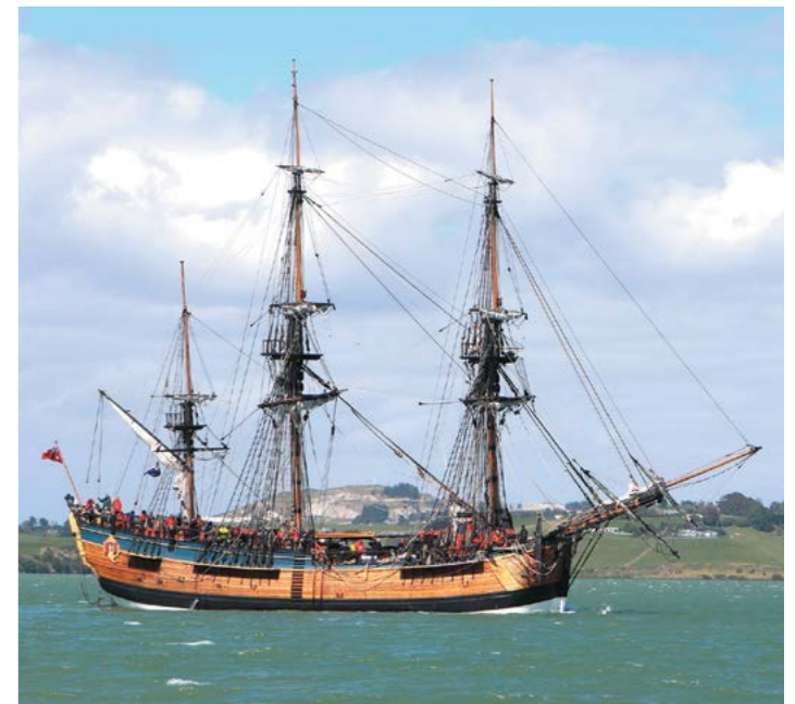
The HMB Endeavour replica passes through the channel.

Tāwhirimātea sent gusts of cold wind across the harbour, prior to the entrance of the Tuia 250 flotilla to Onerahi, which was welcomed by hundreds of local school children.