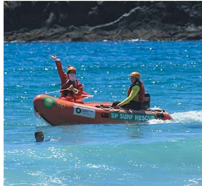
Santa image - Christmas 2018.

During the previous six-month period, the team of volunteer lifeguards rescued 24 people. "Each of these people's day at the beach could have ended very differently, without the help of the volunteers,"