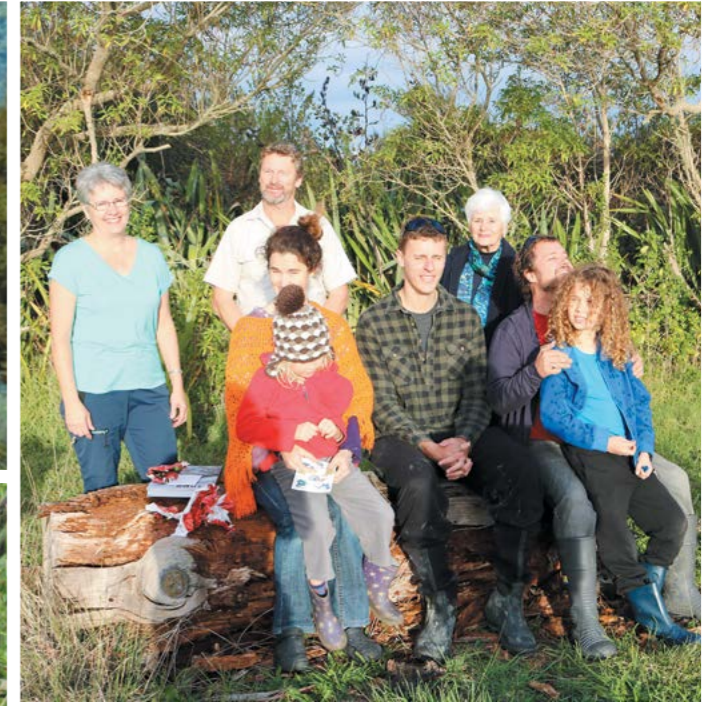
TOP LEFT: Fire - Onerahi fires.