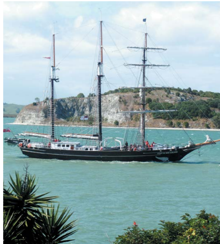
Spirit of New Zealand.