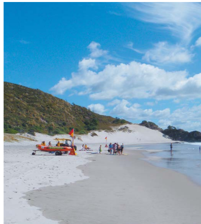
Swim between the flags.

Thankfully, the volunteer lifeguards are well versed on where the rips can be found