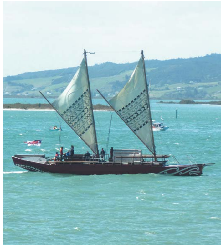
The Waka hourua - Haunui sails past Rat Island.