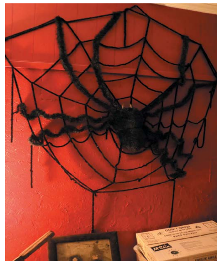
Giant spider decoration.