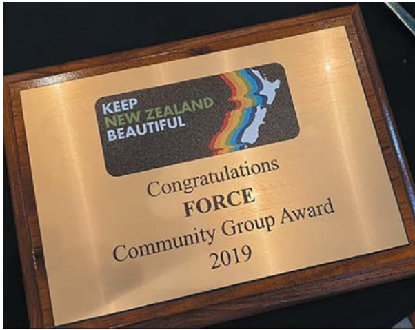
FORCE - Community Group Award.