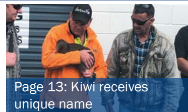
Page 13: Kiwi receives unique name