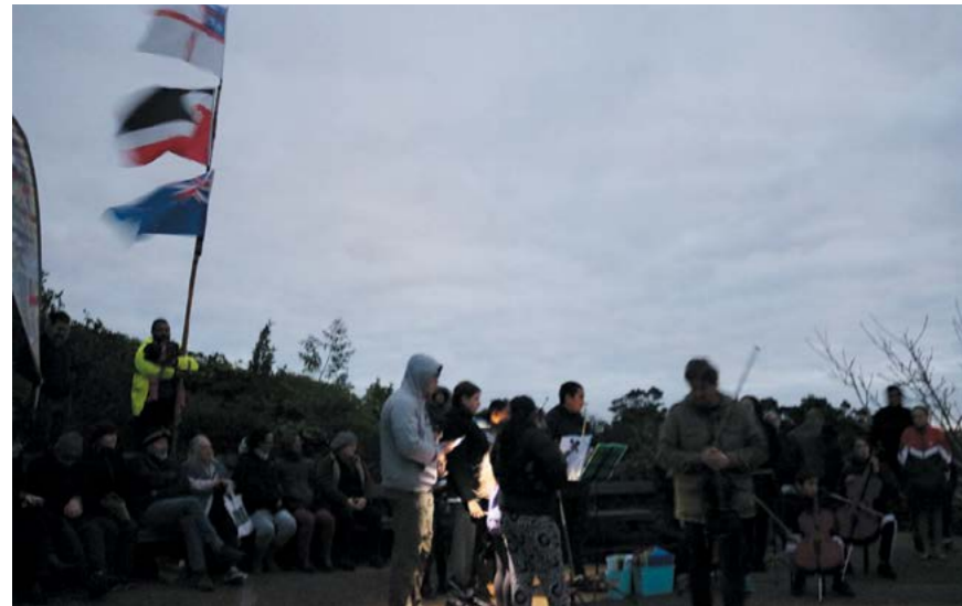
Heralding the beginning of Matariki 2019, with the sound of music.