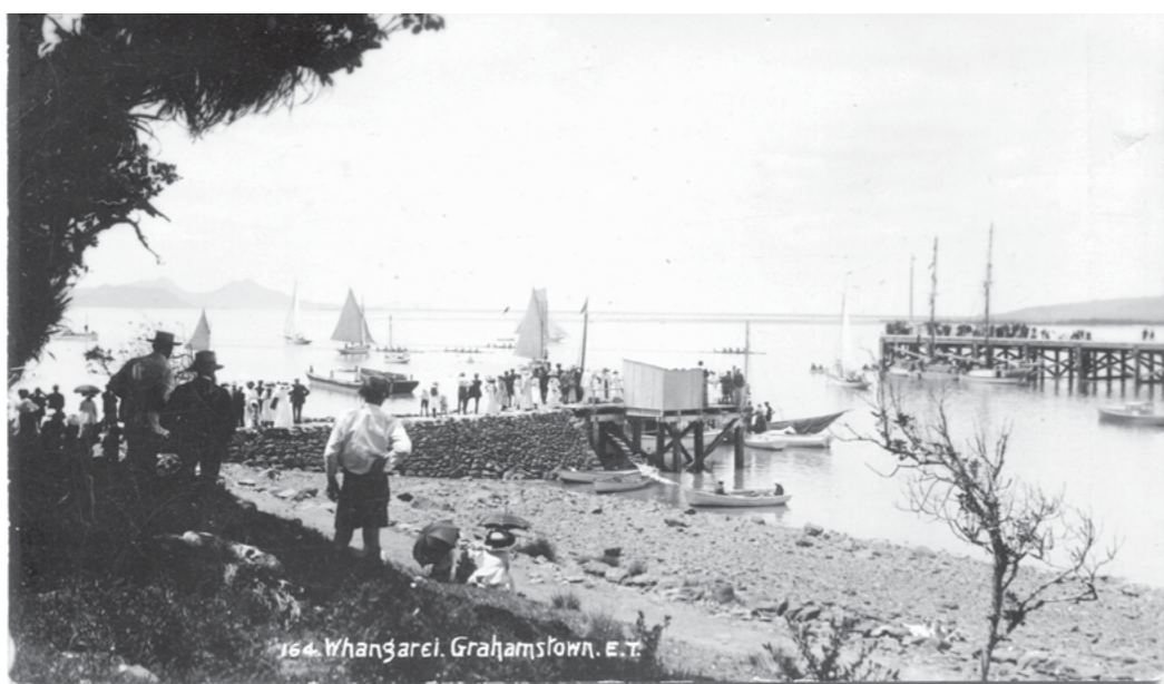
The Onerahi Jetty.

wide range of interesting stories about the local area. To find out more about the launch, visit www.facebook.com/onerahiorbit .