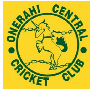
Club badge.