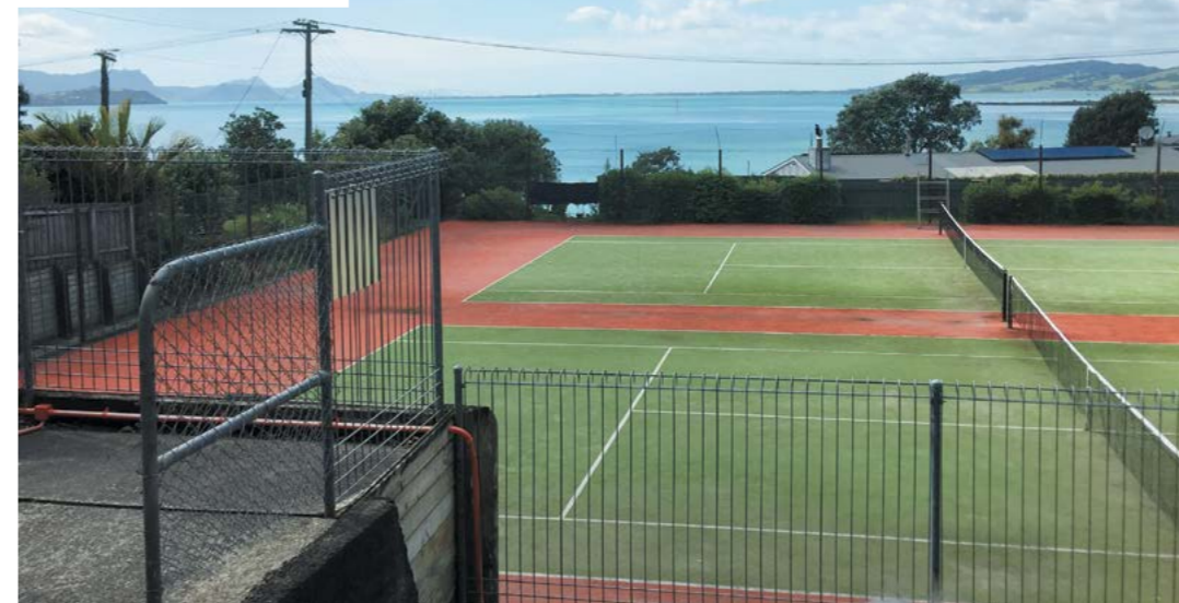
Tennis courts - complete with a beautiful view.

Keeping our youth fit and healthy is very important and the Onerahi Tennis Club's new Hot Shots' Starter Programme is a hit with students from Onerahi Primary School.