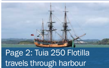
Page 2: Tuia 250 Flotilla travels through harbour